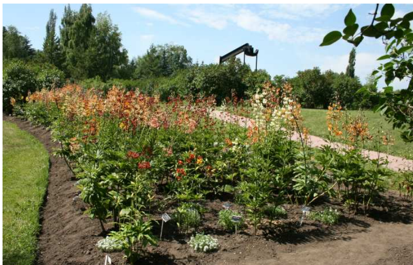
(2012 photo L. Hepper)

Bring your walking shoes and visit the lily beds.