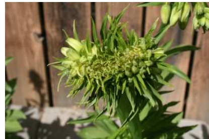
fasciation in lilium is common