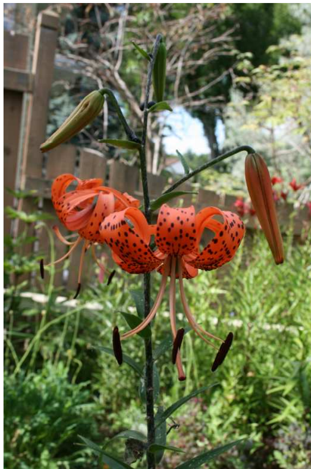
vintage plate artist noted.

Lilium Lancifolium or Tigrinum the TIGER LILY. If your lily produces those little black beads [bulbils] along the stem it is a tiger lily or tiger lily hybrid. Meaning somewhere in its parentage there is L. lancifolium . It is a species lily that should be planted away from modern hybrids unless propagated by seed as most can contain virus that is transferable by insect vector. Do not get rid of your 'Tiger' if you do not see problems with your other lilies. Other lilies have been called tiger lilies but, this is the actual L. tigrinum [tiger].