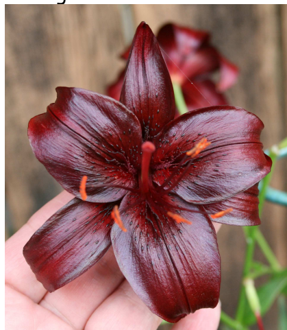
In the Zone