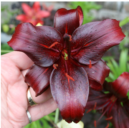
Night Flyer Subtle differences