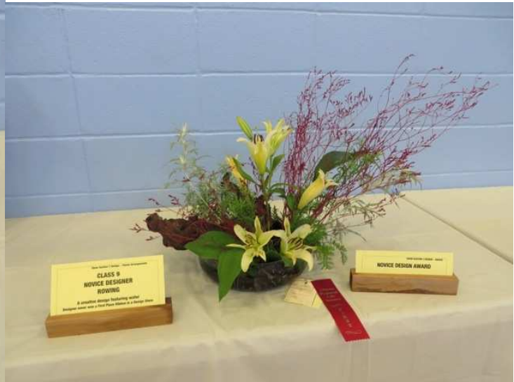
Novice design winner