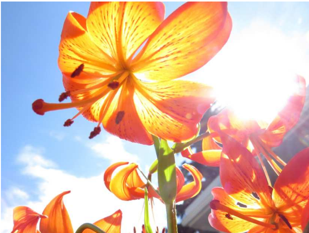
The peoples choice photo contest Winner- Suntan by Dianne Skimming.