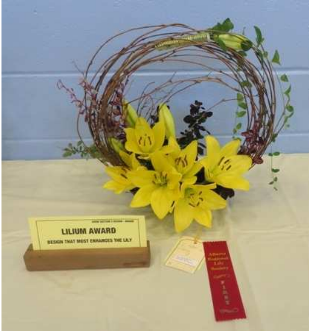
The ARLS Lilium Award