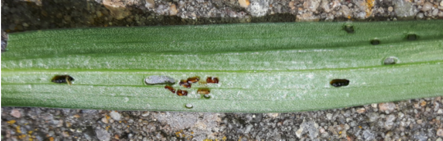
Eggs and early stage larvae

May 23 morning nestled into the densest foliage of the Asiatic Fellner seedling group I bagged one more. All these bags were stacking up on my garage bench. The May 23 beetle laid an egg when I fed her for display at the May27 Fulton Place bulb sale gardeners swap. I wanted a living specimen to display.