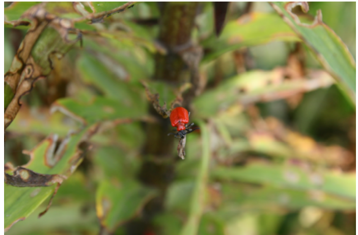
2014 pictures from Olds College L. Hepper photos unrestricted beetle predation damage.

The NALS Quarterly Bulletin June 2017 has a great article on controlling the lily beetle by Paul Siskind.