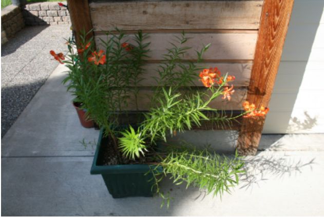
One of the lilies the beetles & larvae found tasty.

ARLS Name tags Call Shauna to get an update.