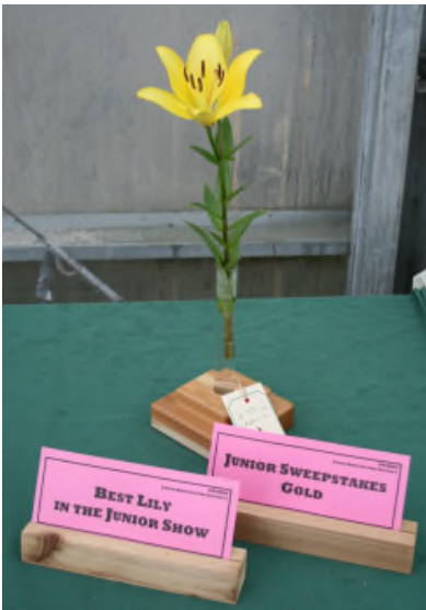
The Alberta Regional Lily Society

NALS 2020 is in the works more information later.