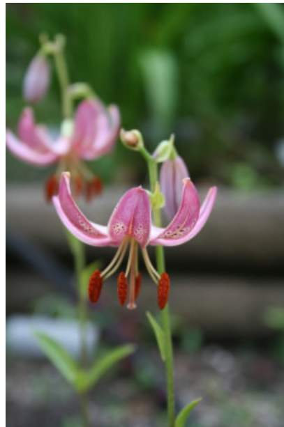
Northern Explorer Fred Tarlton 2013